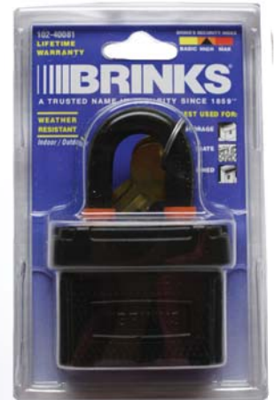
081-95802 Brinks Weather Lam. Steel Short Padlock 1-9/16" W X 1-3/16 Retail: $14.99