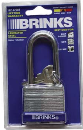
081-95333 Brinks Lam.Steel Long Shank Padlock 1-9/16" W X 2-1/4" H Retail: $14.99