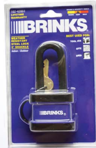
081-95377 Brinks Weather Lam. Steel Long Padlock 1-9/16" W X 1-3/16 Retail: $15.99