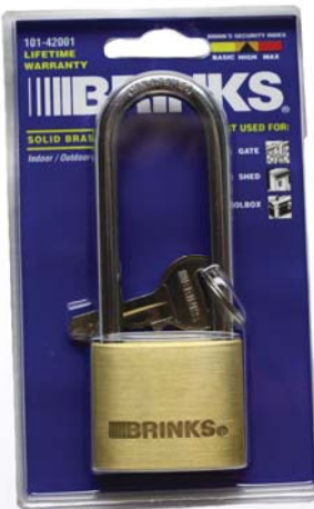
081-95352 Brinks Solid Brass Long Shank Padlock 1-9/16" W X 2" H Retail: $11.99