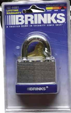
081-95341 Brinks Lam.Steel Short Shank Padlock 1-13/16" W X 1-3/16" H Retail: $11.99